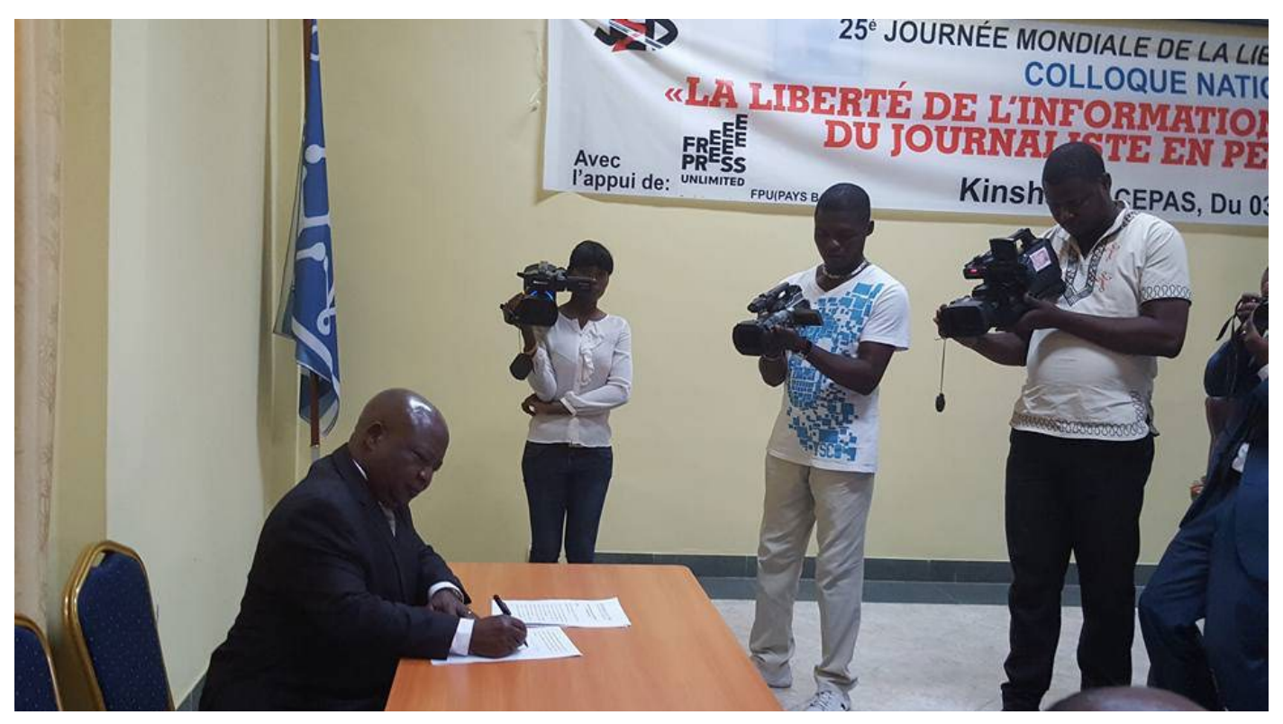
Impartiality, trustworthiness and accuracy are essential for journalists to contribute to a open and inclusive debate in society. The Congolese charter, containing 17 basic principles on journalism, is designed to reform the laws and policies relating to the press in Congo and was signed by many national and provincial stakeholders.