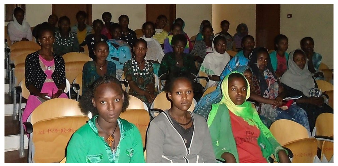
Girls in Ethiopia who were protected from child marriage