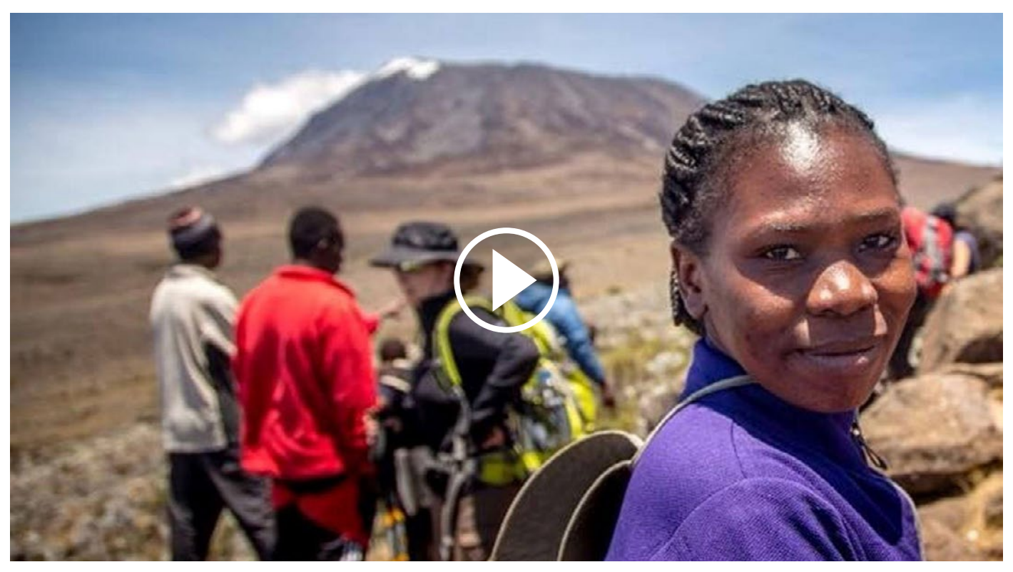
#Women2kilimanjaro advocacy campaign to raise support for laws reforms to allow women to own land legally