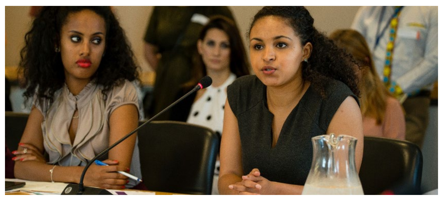
"So you, you're going to the UN?" toolkit for multilateral advocacy on sexual and reproductive health and rights