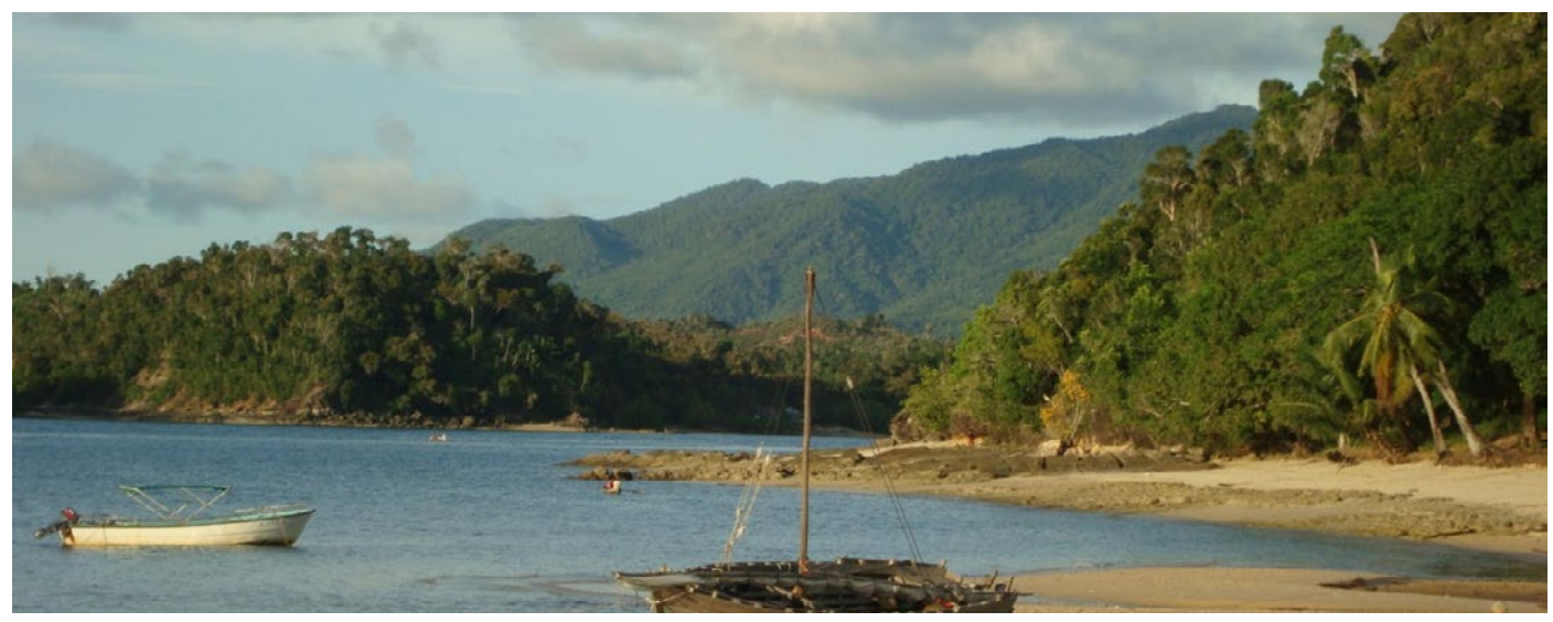
Inclusive dialogue on the development of landscapes in Madagascar