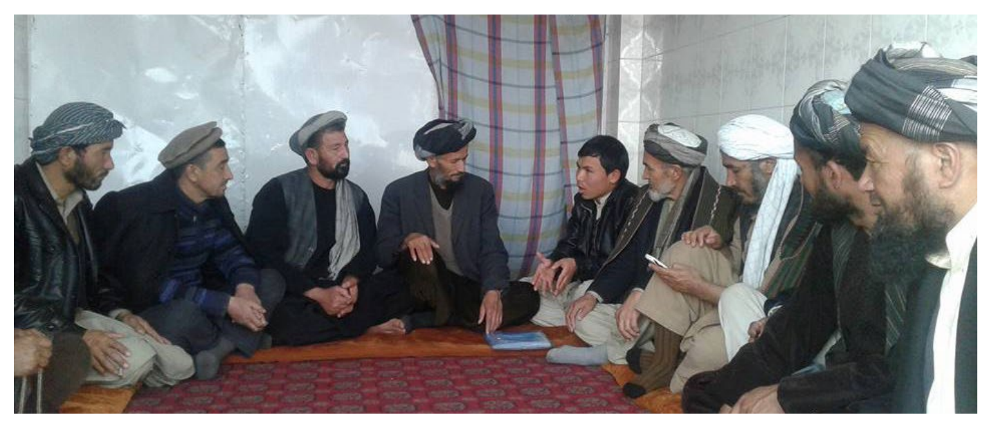
Conversation with religious and traditional leaders in an Afghan community to gain support on women-led advocacy groups (Qoriq village in Charkent district, February 2017)